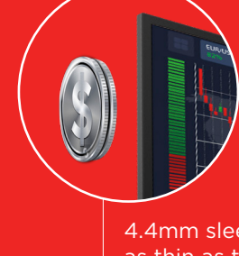
4.4mm sleek: approximately as thin as two USD $1 coins

The ThinkVision M14 boosts productivity with its thin and light form factor. Weighing 598g*, this 4.4mm sleek mobile monitor enables easy portability. The stylish design with a Full-HD, IPS display provides vivid lifelike visuals, ensuring you never miss out on any detail. With a brightness of 300 nits, the ThinkVision M14 offers a stunning visual experience while consuming content online.