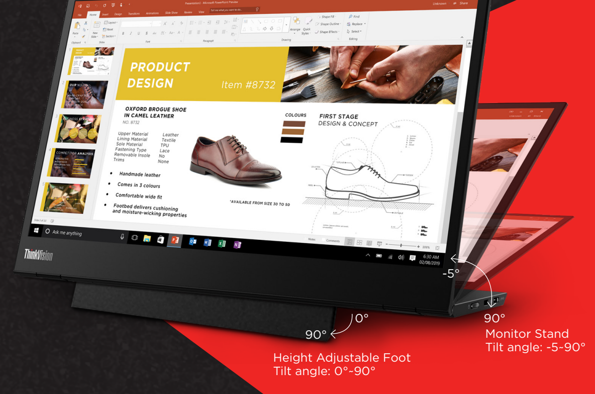
Height Adjustable Foot Tilt angle: 0°-90°