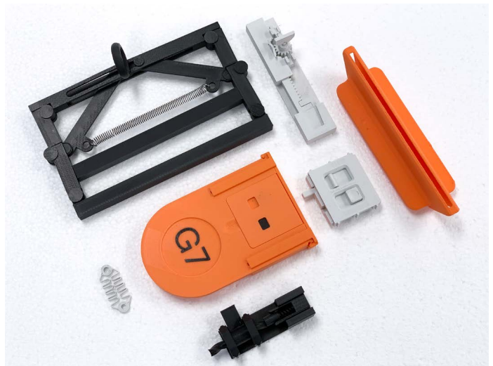
Design engineers at Jamco America utilize METHOD to quickly 3D print complex assemblies with tight tolerances before moving on to the next step in production.

JAMCO AMERICA use the MakerBot METHOD 3D Printer to bring complex aircraft parts to market faster.