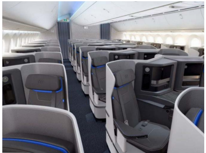
A render of a first class cabin designed and manufactured by Jamco for a global airline.