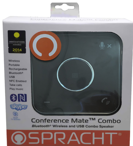
Retail Package suitable for shelf or hanging display