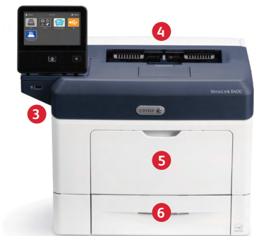
Xerox® VersaLink® B400 Printer Print.