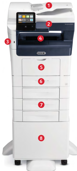
Xerox® VersaLink® B405 Multifunction Printer Print. Copy. Scan. Fax. Email.