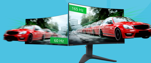
165 Hz Refresh rate