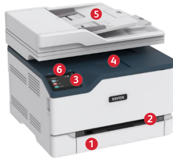
Xerox® C235 Color Multifunction Printer