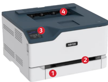
Xerox® C230 Color Printer