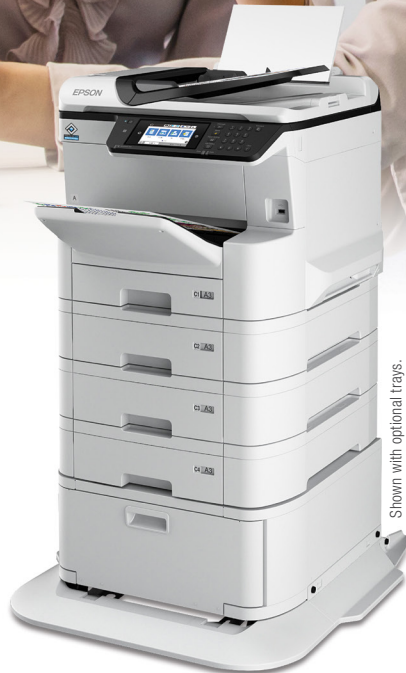
Shown with optional trays.