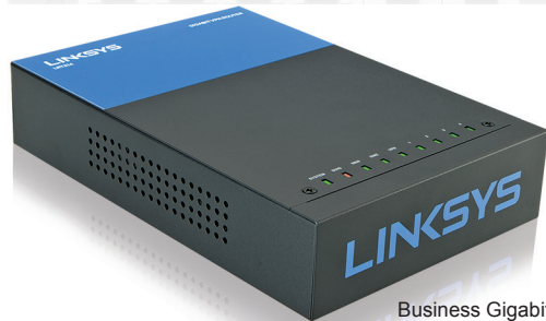
Business Gigabit VPN Router (LRT214)