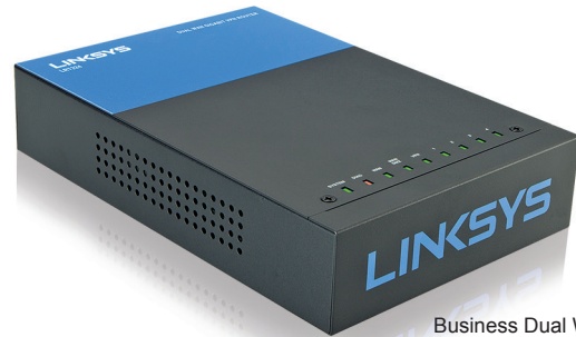
Business Dual WAN Gigabit VPN Router (LRT224)