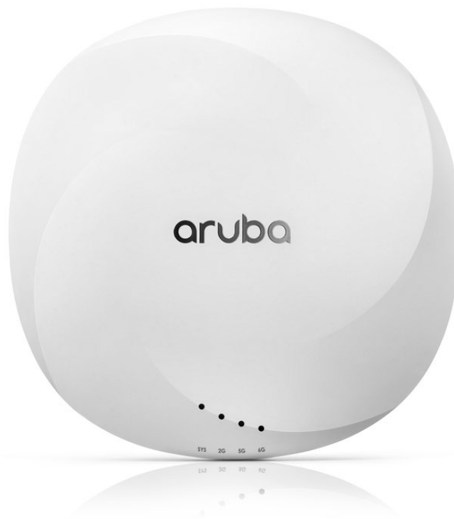
HPE Aruba Networking 650 Series Campus Access Points

By leveraging the 6 GHz band, HPE Aruba Networking 650 Series Campus APs delivers peak performance and far greater capacity than previous generations of Wi-Fi. With up to 1200 MHz of new channels, capacity is nearly tripled – so you can meet growing demand due to bandwidth-hungry video, increasing numbers of client and IoT devices and growth in cloud. Unique to HPE Aruba Networking, the HPE Aruba Networking 650 Series includes ultra tri-band filtering to minimize channel interference and dual configurable 5 Gbps ethernet ports to eliminate coverage gaps, provide greater resiliency, and deliver fast, secure connectivity.