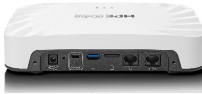
Figure 1. Back of HPE Aruba Networking 100 Series Cellular Bridge

The HPE Aruba Networking 100 Series Cellular Bridge is designed to support both nano-SIM and eSIM technologies (eSIM support is planned for future software release). In addition, the HPE Aruba Networking 100 Series Cellular Bridge includes two 2.5GbE ports ideal for fast and flexible wired connectivity to edge devices.