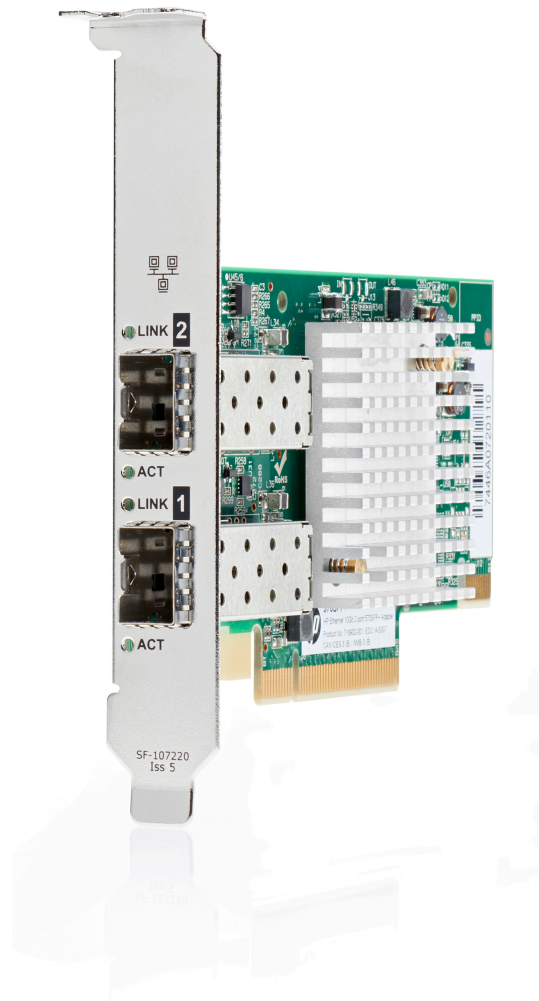
HPE Ethernet 10Gb 2-port 571SFP+ Adapter with the standard bracket

The HPE Ethernet 10Gb 2-port 571SFP+ Adapter based on the Performant SFC9020 controller from Solarflare is designed to address issues facing data center managers today. Equipped to handle the application loads of the latest multi-core processors, the HPE Ethernet 571 adapter also delivers unmatched power efficiency for the consolidation and deployment of high-density servers.