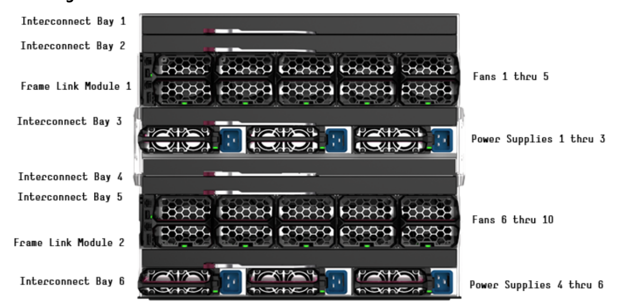
HPE Synergy 12000 Frame - Rear View