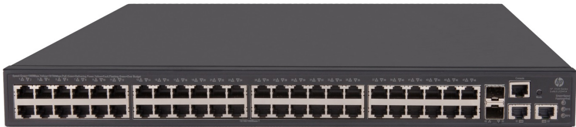
HPE FlexNetwork 5130 48G POE+ 2SFP+ 2XGT (370W) EI Switch (JG941A)