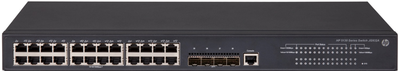
HPE FlexNetwork 5130 24G 4SFP+ EI Switch (JG932A)