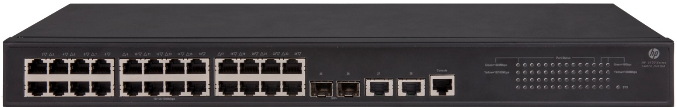
HPE FlexNetwork 5130 24G 2SFP+ 2XGT EI Switch (JG938A)