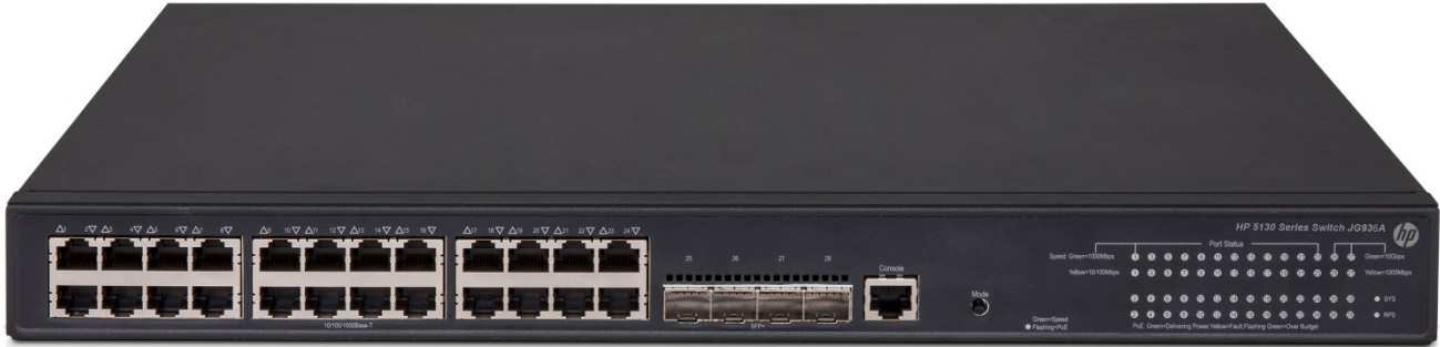
HPE FlexNetwork 5130 24G PoE+ 4SFP+ (370W) EI Switch (JG936A)