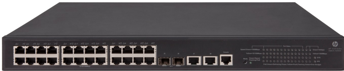
HPE FlexNetwork 5130 24G POE+ 2SFP+ 2XGT (370W) EI Switch (JG940A)