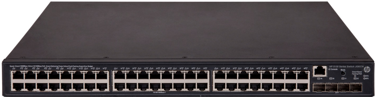
HPE FlexNetwork 5130 48G PoE+ 4SFP+ (370W) EI Switch (JG937A)