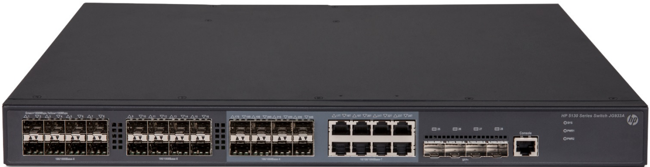
HPE FlexNetwork 5130 24G SFP 4SFP+ EI Switch (JG933A)