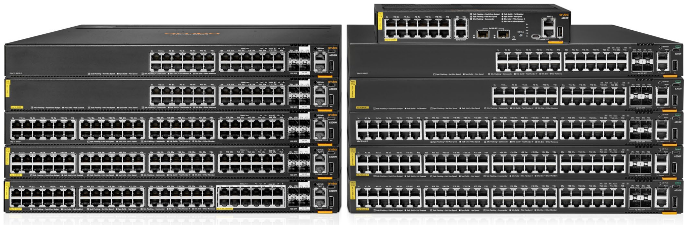
HPE Aruba Networking CX 6200 Switch Series

HPE Aruba Networking Dynamic Segmentation extends the HPE Aruba Networking's foundational wireless role-based policy capability to HPE Aruba Networking wired switches. What this means is that the same security, user experience and simplified IT management can be enjoyed throughout the network. Regardless of how users and IoT devices connect, consistent policies are enforced across wired and wireless networks, keeping traffic secure and separate.