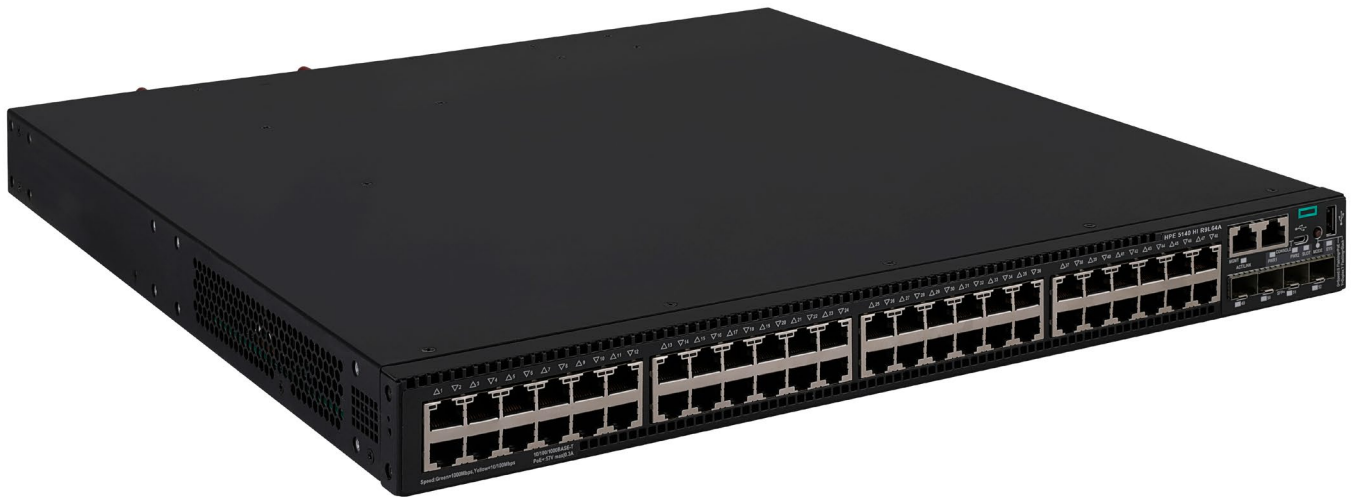
HPE Networking Comware Switch Series 5140 HI

This switch series also includes Smart MC at no additional cost and combined with Intelligent Management Center (IMC), provides both embedded network management, enhanced network visibility and automation