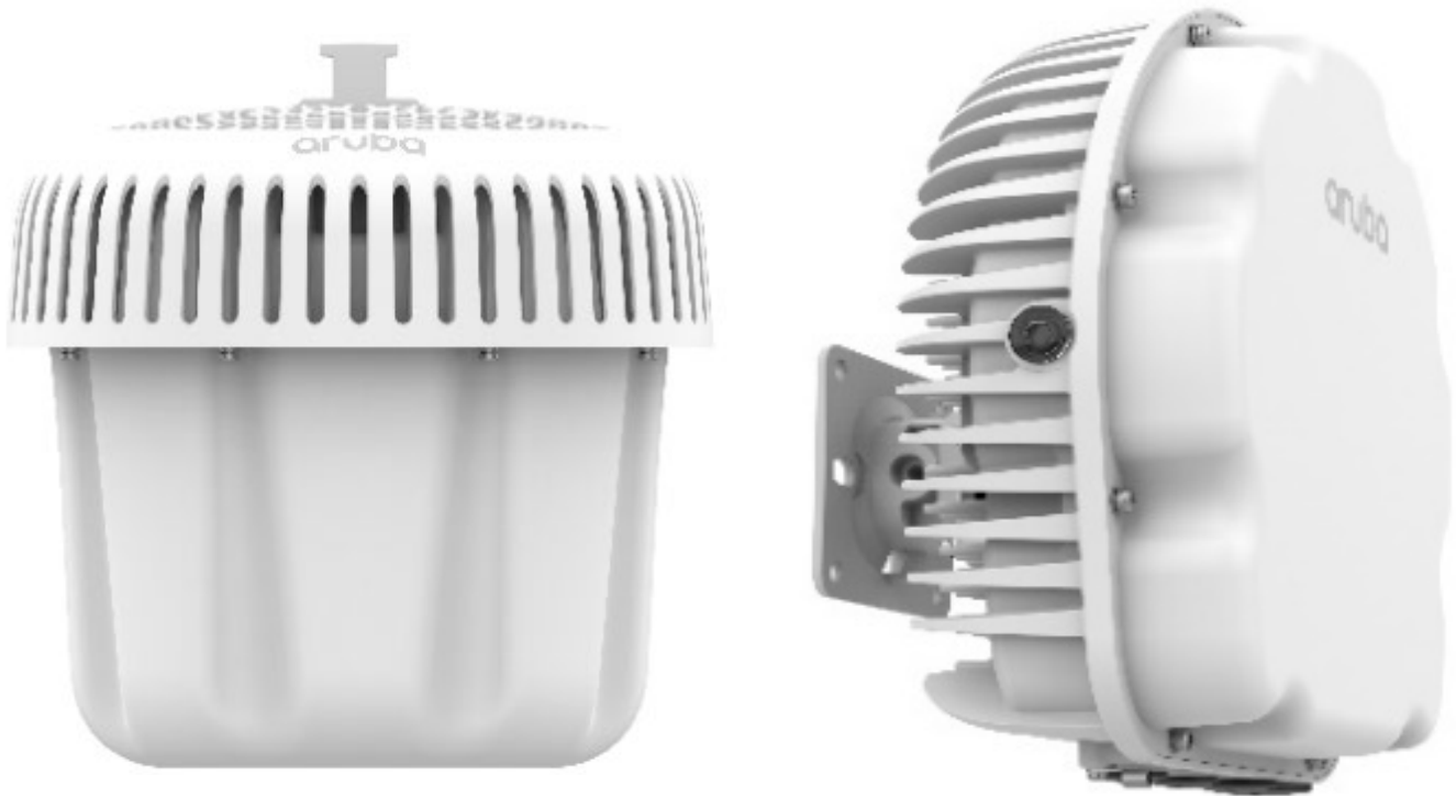
HPE Aruba Networking 580EX Series Hazardous Location Access Points

HPE Aruba Networking Wi-Fi 6 access points provide high-performance connectivity in dense mobile and IoT environments. With maximum aggregate on air data rates of 2.97 Gbps (HE80/HE20), the HPE Aruba Networking 580EX Series APs deliver the speed and reliability needed for demanding environments.