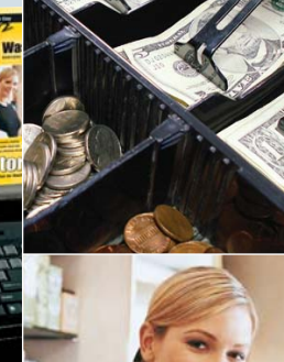
Big Business Tools. Small Business Attitude.

The Wasp WCD5000 cash drawer features all-metal, rugged construction and a compact design, perfect for retail environments with limited space. Engineered for easy installation and use, the WCD5000 offers two media slots for separating checks and coupons. The WCD5000 easily integrates with Epson® or Epson® compatible printers.