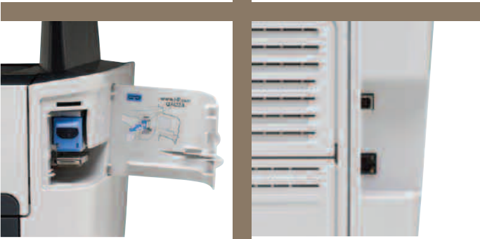
20-sheet electric stapler

OVERALL PRINTERS Hewlett-Packard Company