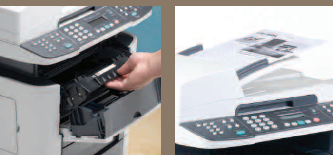
Front door access for hassle-free maintenance