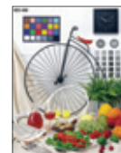
*3 Photo Bike Image

Print Speeds Note: Print speeds may vary depending on print conditions