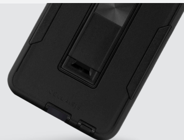
CORNER DROP PROTECTION