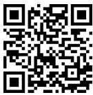
F110 3D demo