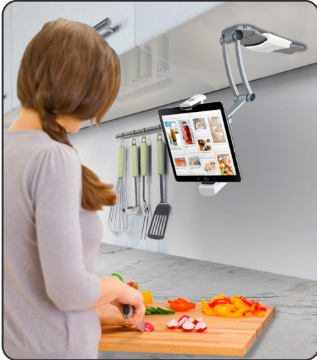
Ideal for kitchen cabinets

Compatible with iPad Air, iPad Mini, iPad (2nd-4th generation) Kindle Fire, Nexus, Galaxy and most other 7-10-inch screen tablets between 6-8.5 inches wide