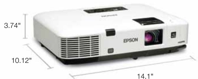
▲ Compact and portable design