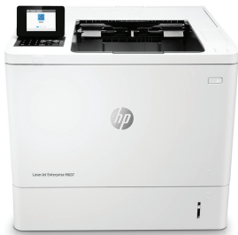
HP LaserJet Enterprise M607n

This HP LaserJet Printer with JetIntelligence combines exceptional performance and energy efficiency with professional-quality documents right when you need them – all while protecting your network from attacks with the HP's deepest security 1