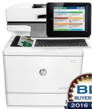
HP Inc. Color LaserJet Pro MFP M577 Series Outstanding Color MFP for Large Workgroups