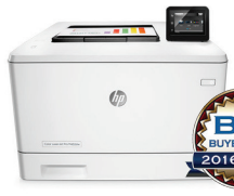
HP Inc. Color LaserJet Pro MFP M452 Series Outstanding Color MFP for Small Workgroups