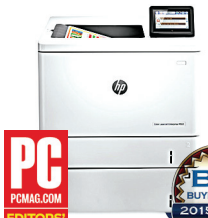
HP CLJ Enterprise M553 series