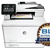
HP Inc. Color LaserJet Pro MFP M477 Series Outstanding Color MFP for Small Workgroups