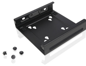
ThinkCentre® Tiny VESA Mount II