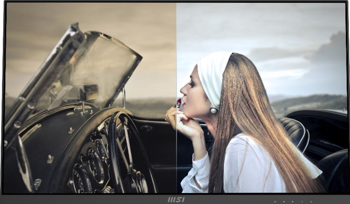
Less Blue Light

The Less Blue Light Mode filters visual exposure to the blue spectrum light during daily use scenarios and bring the most comfortable viewing experience for users.