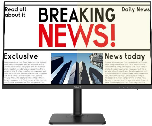
Color Mode Setting