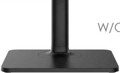
W/O Less Blue Light