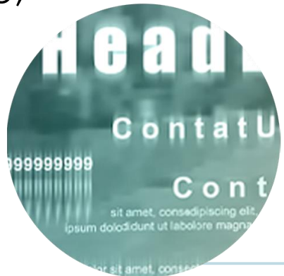
Lower Refresh Rate

High refresh rate display provides a better viewing experience. Also, the more images shown in the same time, the less burden will impose to your eyes.