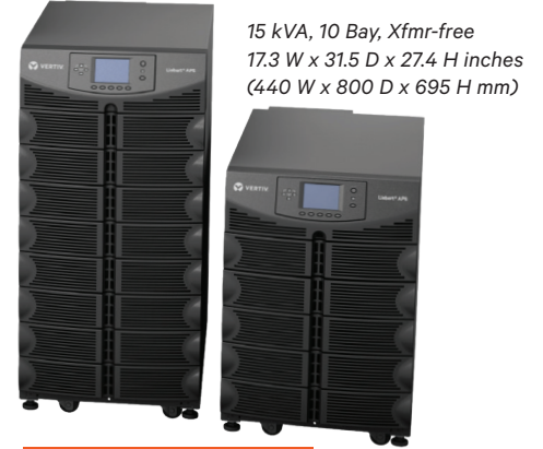
15 kVA, 10 Bay, Xfmr-free 17.3 W x 31.5 D x 27.4 H inches (440 W x 800 D x 695 H mm)