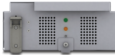
Liebert® APS Battery Module APSBATMODCU includes 2 battery modules, or 1 complete battery string. each complete string uses 2 bays in the Liebert APS.