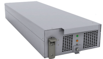
Liebert® APS Charger Module 10A battery charger that operates in parallel with the chargers integrated in each Power module. To increase runtime in the Liebert APS, this 10A charger should be used when battery string to power module ratio is greater than 3:1.