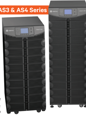
15 kVA, 12 Bay, Xfmr-based 17.3 W x 31.5 D x 41.7 H inches (440 W x 800 D x 1060 H mm)