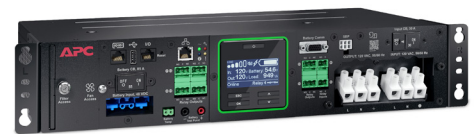
APC Smart-UPS Industrial On-Line 1300W