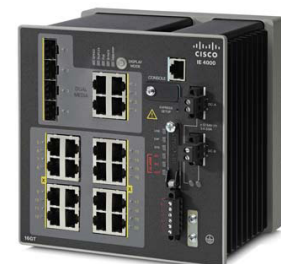
Cisco Industrial Ethernet 4000 series