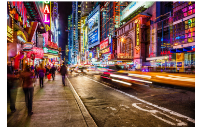
Dynamic Message Signs