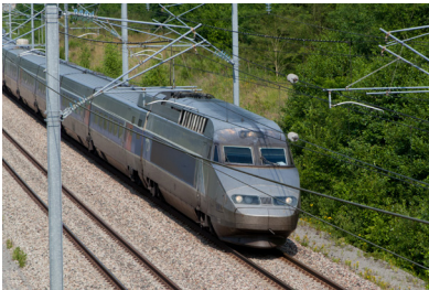
Rail Crossings Signals