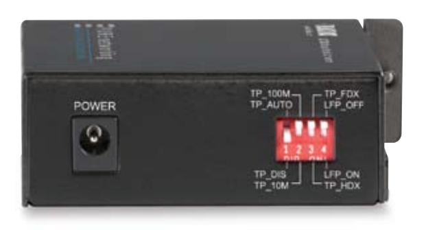
10-/100-Mbps models have DIP switches to set speed, duplex, and link-fault passthrough.