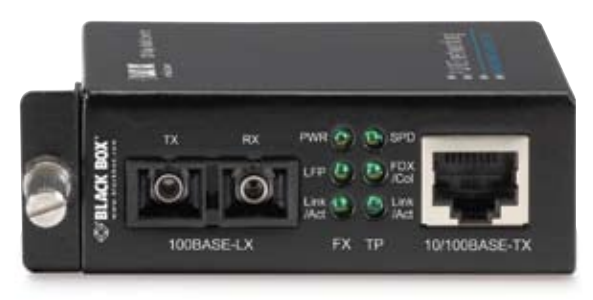
Diagnostic LEDs on the front panel enable you to troubleshoot at a glance.