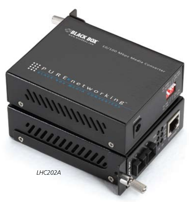
Pure Networking Media Converters may be inexpensive, but they're not cheap—they're built solid with a sturdy metal case.