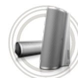
Lenovo 500 2.0 Bluetooth® Speaker