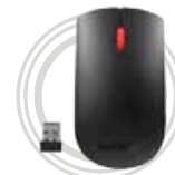
Lenovo 510 Wireless Mouse