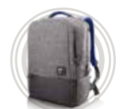
Lenovo 15.6" NAVA On-trend Backpack

Lenovo reserves the right to alter product offerings and specifications at any time, without notice. Lenovo makes every effort to ensure accuracy of all information but is not liable or responsible for any editorial, photographic or typographic errors. All images are for illustration purposes only. For full Lenovo product, service and warranty specifications visit www.lenovo.com . Lenovo makes no representations or warranties regarding third party products or services. Trademarks: The following are trademarks or registered trademarks of Lenovo: Lenovo, the Lenovo logo, ideapad, IdeaCentre, yoga and yoga home. Microsoft, Windows and Vista are registered trademarks of Microsoft Corporation. Ultrabook, Celeron, Celeron Inside, Core Inside, Intel, Intel Logo, Intel Atom, Intel Atom Inside, Intel Core, Intel Inside, Intel Inside Logo, Intel vPro, Itanium, Itanium Inside, Pentium, Pentium Inside, vPro Inside, Xeon, Xeon Phi, and Xeon Inside are trademarks of Intel Corporation in the U.S. and/or other countries. Other company, product and service names may be trademarks or service marks of others. Visit www.lenovo.com/lenovo/us/en/safecomp/ periodically for the latest information on safe and effective computing. ©2017 Lenovo. All rights reserved.