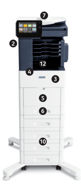
Xerox® VersaLink® C600 Colour Printer