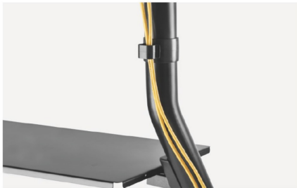
Cable Management creates a clean appearance