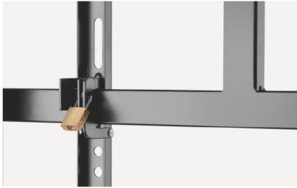
Anti-Theft Design great for commercial environments (padlock required)