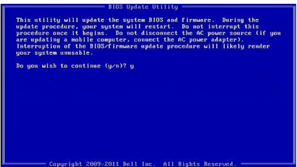
Figure 1. DOS BIOS Update Screen