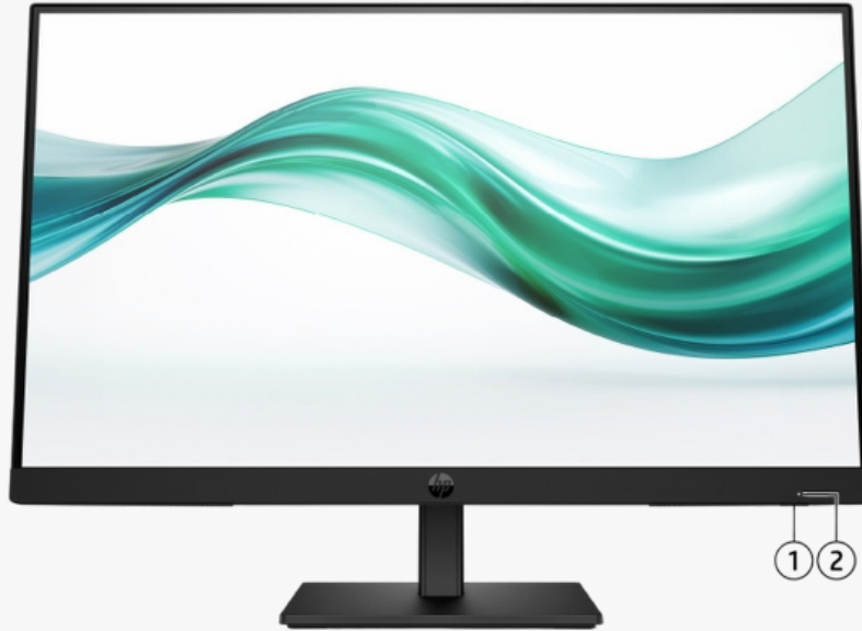
1. Power button