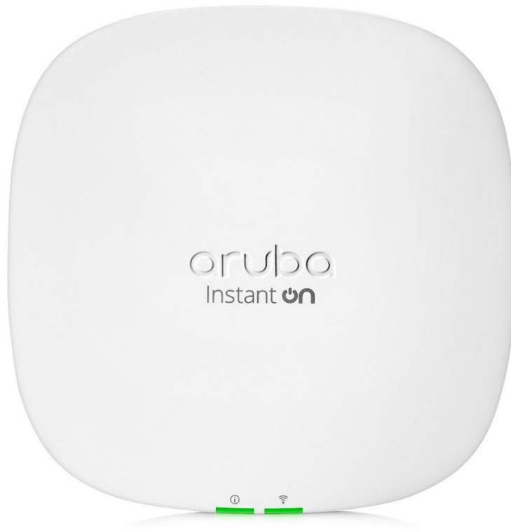
HPE Networking Instant On Access Points AP25

Features of the AP25 include orthogonal frequency-division multiple access (OFDMA), multi-user MIMO and target wake time (TWT). With up to 4 spatial streams (4SS) and 160MHz channel bandwidth (HE160), the AP25 provides groundbreaking wireless capabilities for businesses looking to boost performance and future-proof their networks.