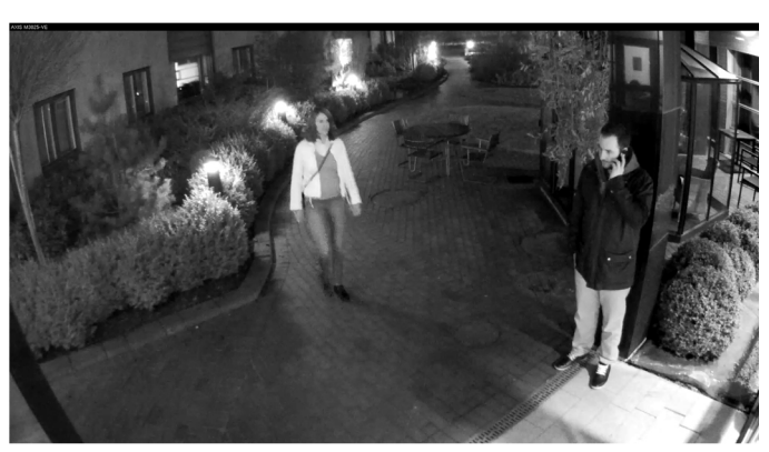
The above images from AXIS M3025-VE illustrate the camera's day/night functionality: at left, day mode; at right, night mode.