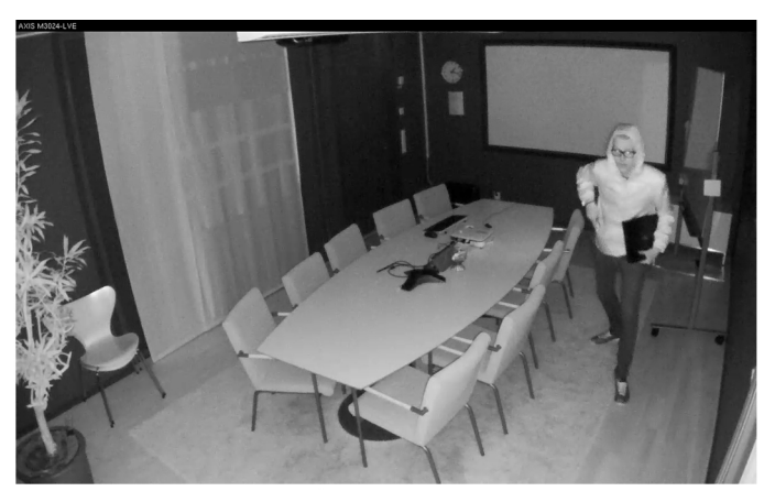
The above images from AXIS M3024-LVE—depicting the same scenario of a man with a small flashlight in a dark room—show the difference that IR illumination makes for surveillance in the dark. The image at left is without the use of IR illuminators. The image at right uses IR light from the camera's built-in IR LEDs. IR light is invisible to the human eye but visible to the camera.