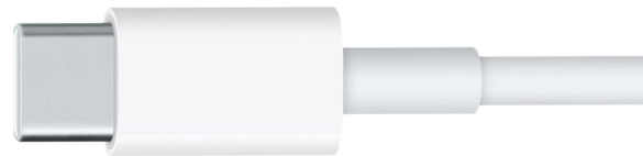
Reversible USB Type C Connectors