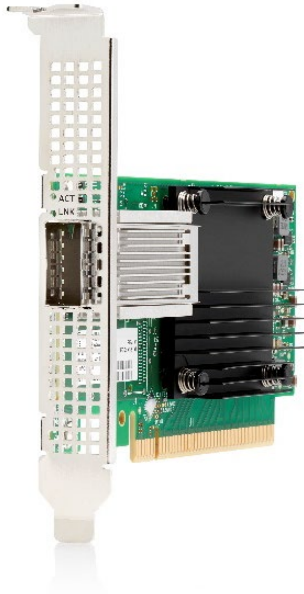
HPE Ethernet 100Gb 1-port QSFP28 MCX515A-CCAT Adapter

The HPE Ethernet 100Gb 1-port QSFP28 MCX515A-CCAT Adapter for ProLiant servers are designed to provide high performance Ethernet connectivity, it is ideal for virtual server and cloud computing environments.