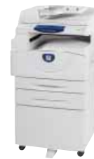
WorkCentre 5020DN shown with Duplex Automatic Document Feeder, optional Tray 2 and Stand

UL – 60950 – 1 / CSA – 60950 – 1 – 03, CE Mark applicable to Directives 2006 / 95 / EC, 2004 / 108 / EC, 1999 / 5 / EC