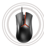
Y Gaming Optical Mouse