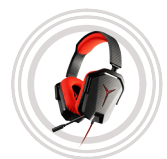
Y Gaming Stereo Headset

* Example of Lenovo Legion catalogue naming convention