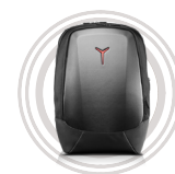
Y Gaming Armored Backpack