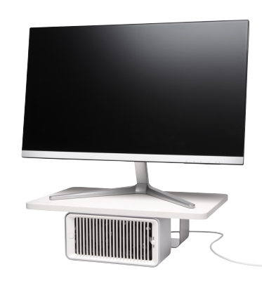
CoolView™ Wellness Monitor Stand with Desk Fan

K55855WW K55460WW (with air purifier) K55464WW (with heater)