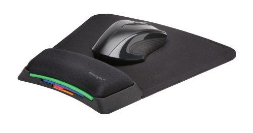
SmartFit® Mouse Pad

K52789WW (Plus - Black) K56146USF (Plus - Gray) K50416WW (Comfort)