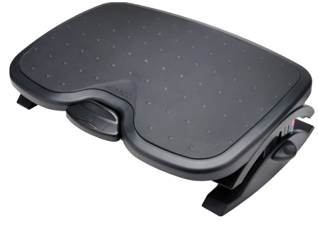
✓ SmartFit® SoleMate™ Foot Rest

K50345WW (Pro Elite) K50409WW (Pro Ergonomic) K50416WW