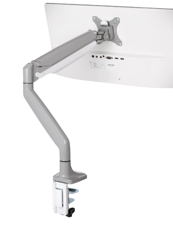
SmartFit® One-Touch Height Adjustable Single Monitor Arm

K55855WW K55460WW (with air purifier) K55464WW (with heater)