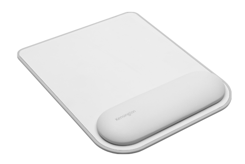
ErgoSoft™ Wrist Rest Mouse Pad