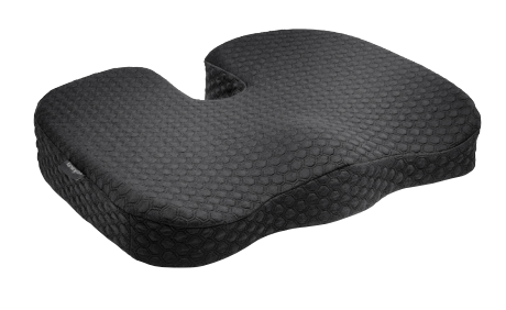
Premium Cool-Get Seat Cushion