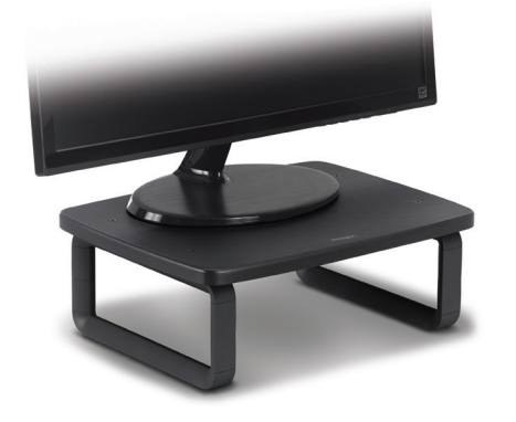
Monitor Stand with SmartFit® System