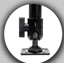
Ball Socket Joints