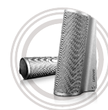
Lenovo 500 2.0 Bluetooth® Speaker