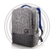
Lenovo 15.6" NAVA On-trend Backpack