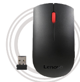
Lenovo 510 Wireless Mouse