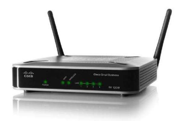
Figure 1. Cisco RV120W Wireless-N VPN Firewall

The Cisco® RV120W Wireless-N VPN Firewall combines highly secure connectivity – to the Internet as well as from other locations and remote workers – with a high-speed, 802.11n wireless access point, a 4-port switch, an intuitive, browser-based device manager, and support for the Cisco FindIT Network Discovery Utility, all at a very affordable price. Its combination of high performance, business-class features and top-quality user experience takes basic connectivity to a new level (Figure 1).