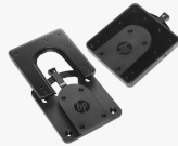
HP Quick Release Bracket 2

Use the HP Quick Release Bracket 2 to attach your HP Desktop Mini to an HP display 1 and a variety of stands, arms or wall mounts. 2 The failsafe "Sure-Lock" mechanism snaps the PC securely in place, and can be further secured with a theft-deterrent security screw.