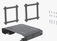
HP Desktop Mini v4+ VESA Sleeve

Wrap your HP Desktop Mini PC in the HP Desktop Mini v4+ VESA Sleeve to securely mount it—with or without an Expansion Module 1,2 —behind your display, position the solution on a wall, and lock it down with the integrated security bracket and optional HP Ultra-Slim Cable Lock.