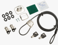
HP Business PC Security Lock v3 Kit

Help prevent chassis tampering and secure your PC and display in workspaces and public areas with the affordable HP Business PC Security Lock v3 Kit.