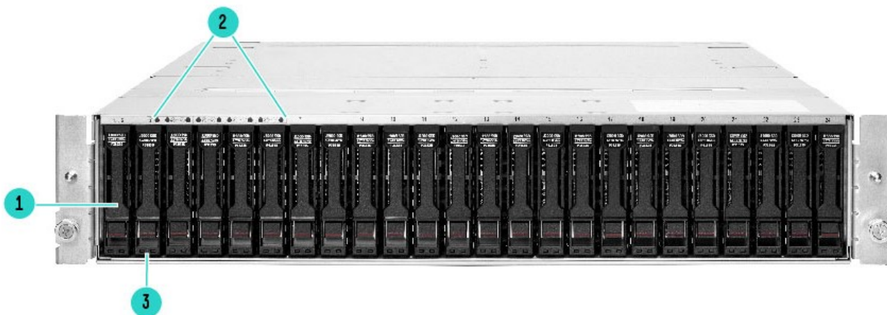
HPE J2000 Flash Enclosure

The storage market continues to evolve in many areas including the growing adoption of flash storage. The development of NVMe SSDs has unleashed the power of flash. NVMe-oF is the latest storage networking protocol designed for use with NVMe SSDs. It is at the beginning of a multi-year evolution that will reshape storage networking and storage solutions. NVMe-oF delivers nearly the same performance as internal NVMe SSDs, while providing the flexibility and shared efficiencies of being network attached. This allows the HPE J2000 Flash Enclosure to redefine direct attached storage (DAS) with greater performance and flexibility than traditional solutions (like JBODs), as well as providing an important building block for modern IT architectures such as Storage-as-a-Service (SaaS), Software Defined Storage (SDS), and Composable Infrastructure solutions.