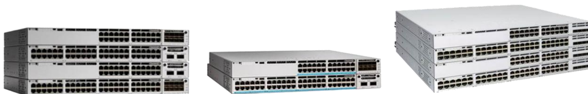
Figure 1. Cisco Catalyst 9300 Series switches

The Cisco Catalyst 9300 Series is made up of nineteen modular uplink switch models and fourteen fixed uplink switch models.