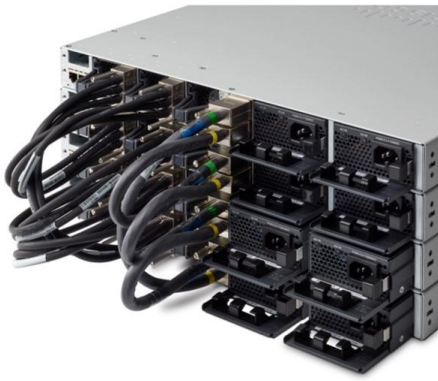
Figure 7. Cisco Catalyst 9300 Series StackPower