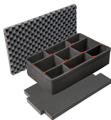
1595TPKIT TrekPak Case Divider Kit