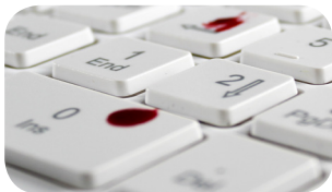
Easily detect contamination