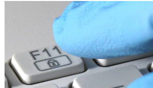
No need to disconnect during cleaning