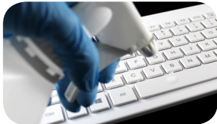
Wipe, Spray or Rinse