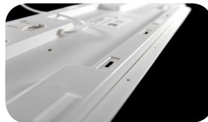
For use on wall-mounts/flip up keyboard trays