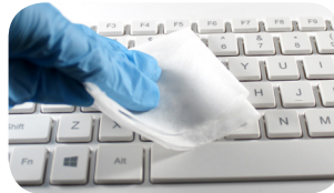
Use standard hard surface cleaners