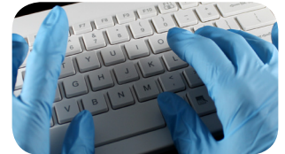
Tactile typing at the speed of a regular keyboard